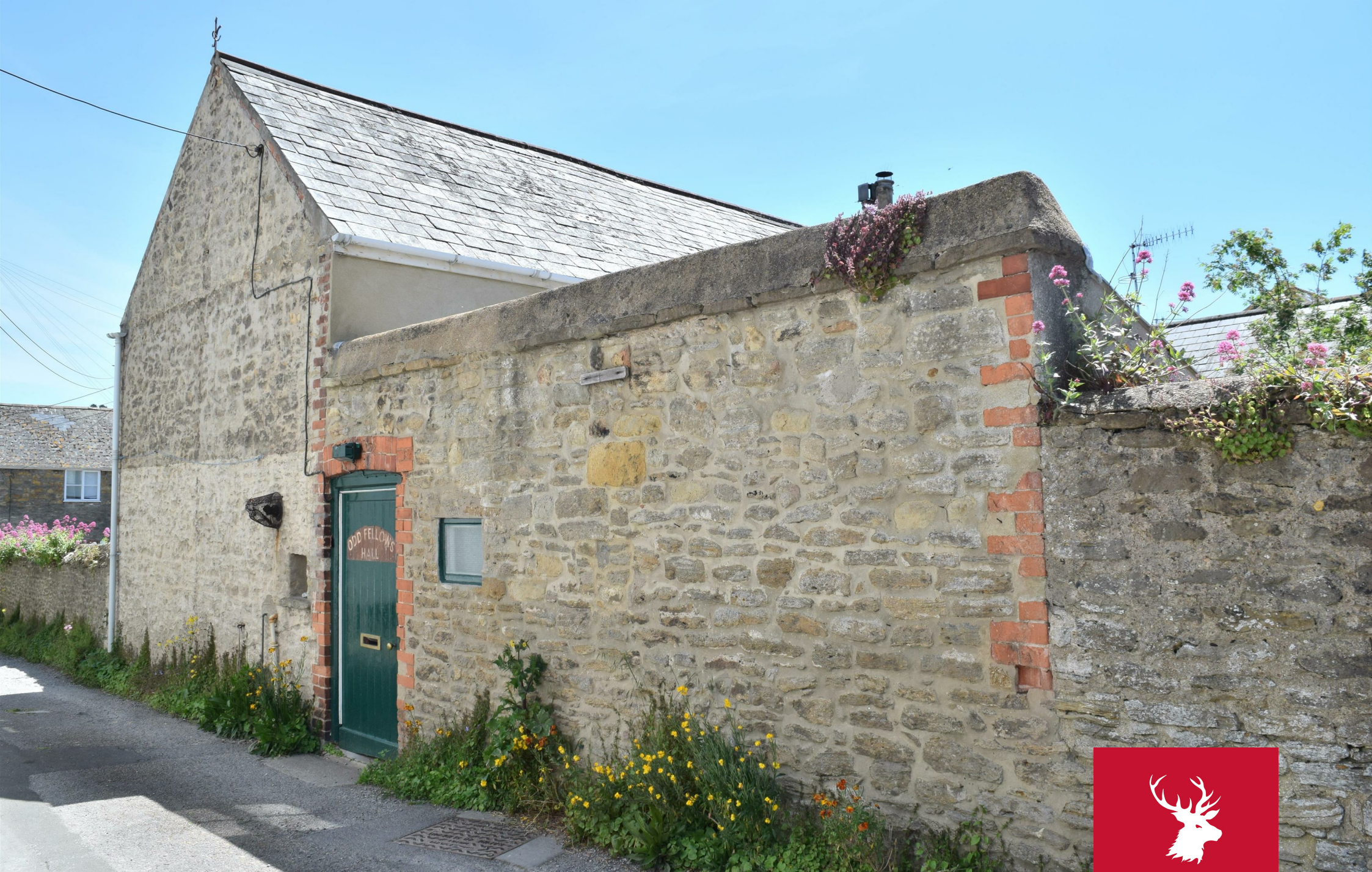
Odd Fellows Hall